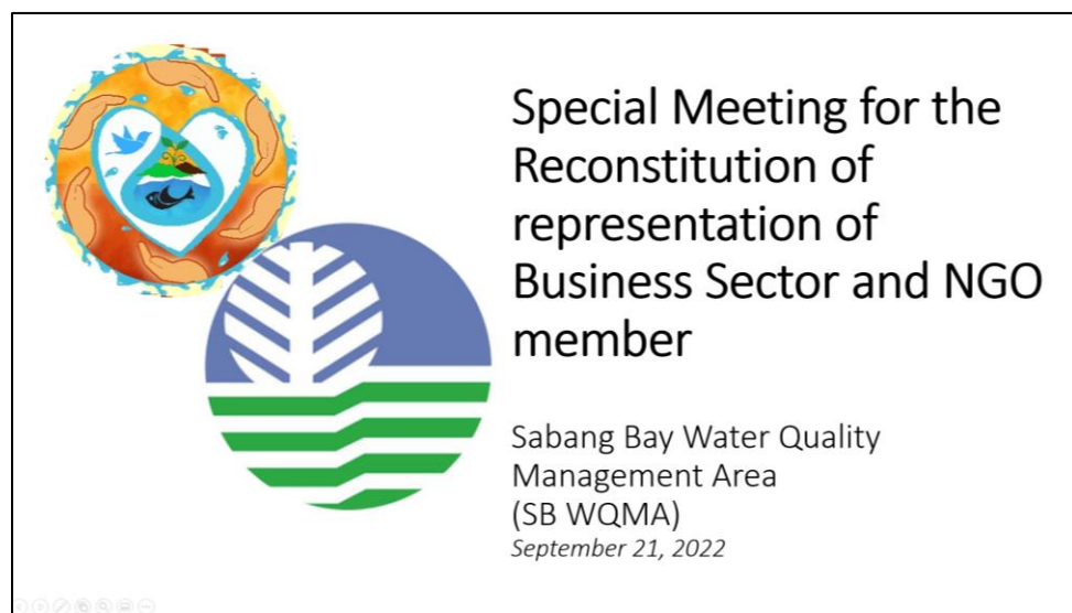
Figure 3. Presentation on the Special Meeting for the reconstitution of representation of Business sector and NGO member