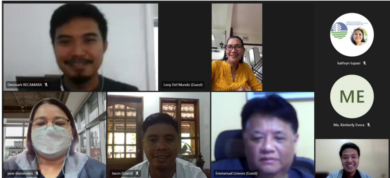
Figure 1. Photo opportunity during the special meeting