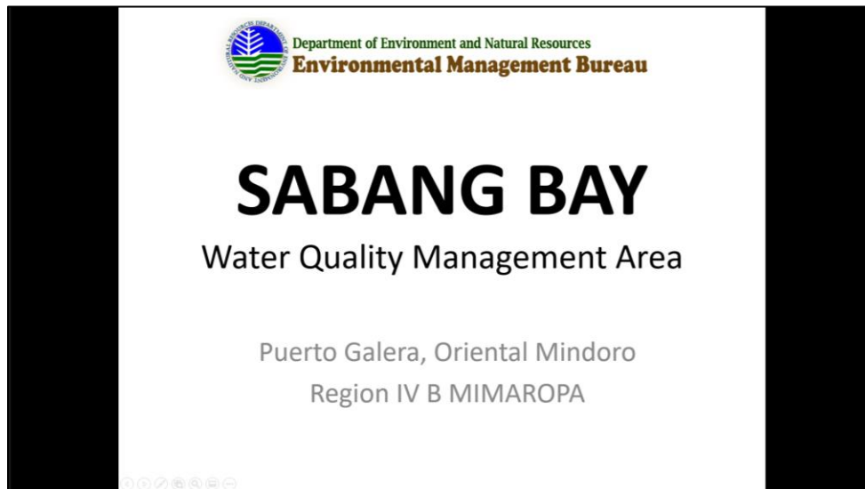
Figure 2. Presentation of the Overview of Sabang Bay WQMA