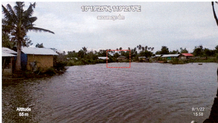
Photo 1. Extraction observed during the CDO monitoring on August 1, 2022.

Republic of the Philippines Department of Environment and Natural Resources Region IV- MIMAROPA COMMUNITY ENVIRONMENT AND NATURAL RESOURCES OFFICE Barangay III (Poblacion), Roxas, Palawan Contact No. 09171606578 / 09175028647 Email address: cenroroxaspalawan@denr.gov.ph