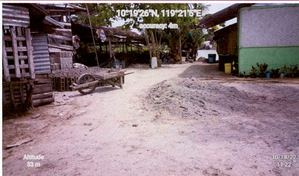
Photo 3. Hollow Blocks production in Brgy. III, Roxas, Palawan

Barangay III (Poblacion), Roxas, Palawan Contact No. 09171606578 / 09175028647 Email address: cenroroxaspalawan@denr.gov.ph