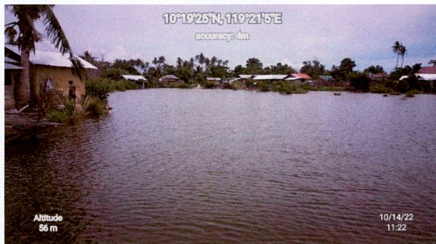
Photo 2. No extraction was observed during the follow-up CDO monitoring on October 14, 2022