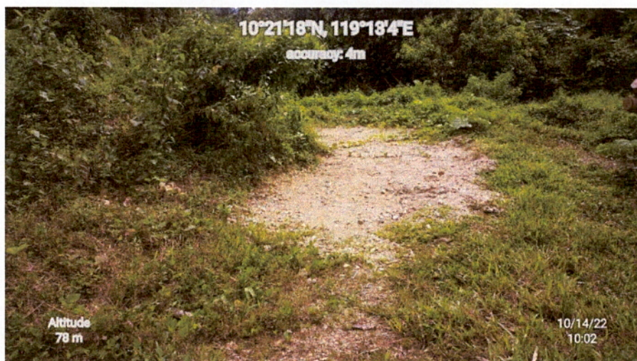
Photo 1. No sand and gravel stockpiles were observed in the area.

Barangay III (Poblacion), Roxas, Palawan Contact No. 09171606578 / 09175028647 Email address: cenroroxaspalawan@denr.gov.ph