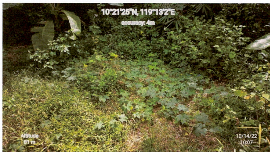
Photo 2. Growth of vegetation in the previous stockpile area denoting extraction inactivity.