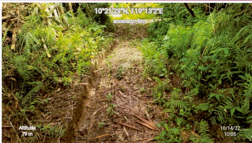
Photo 3. Tire tracks were imprinted on the mud.

Barangay III (Poblacion), Roxas, Palawan Contact No. 09171606578 / 09175028647 Email address: cenroroxaspalawan@denr.gov.ph