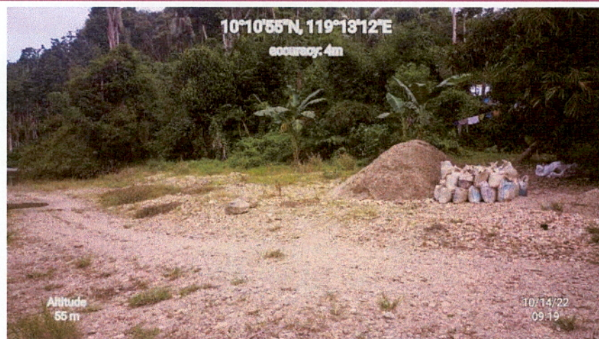
Photo 3. No hollowblocks production was observed during the inspection. However, there are sacked and stockpiled SAGs noted.

Barangay III (Poblacion), Roxas, Palawan Contact No. 09171606578 / 09175028647 Email address: cenroroxaspalawan@denr.gov.ph