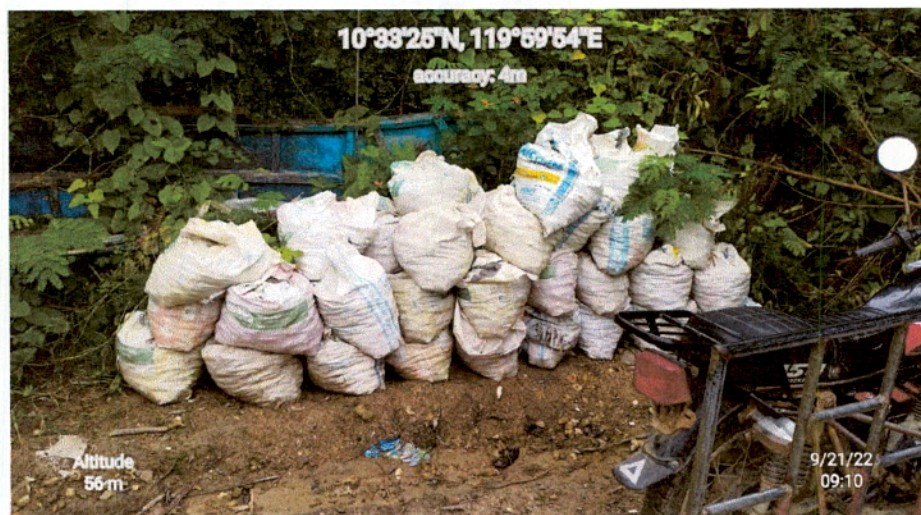
Photo 2. Sacked SAG materials observed in Brgy. Poblacion, Araceli, Palawan