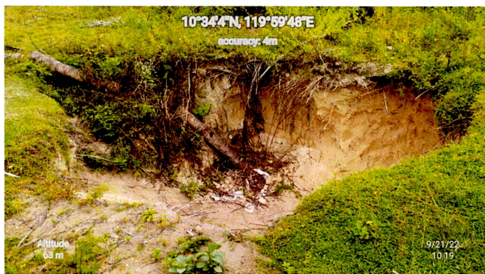
Photo 12. Source of Sand Materials of Mr. Ezuleo. This pit poses a safety hazard.