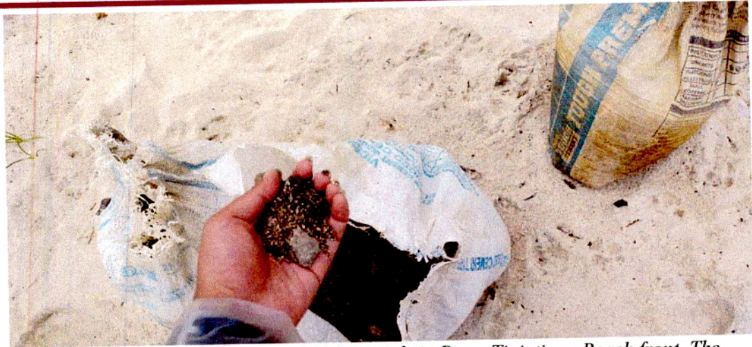
Photo 4 and 5. Observed Sacked SAG materials in Brgy. Tinintinan Beach front. The sacked SAG has a different material than the beach sand, indicating different source.

Barangay III (Poblacion), Roxas, Palawan Contact No. 09171606578 / 09175028647 Email address: cenroroxaspalawan@denr.gov.ph