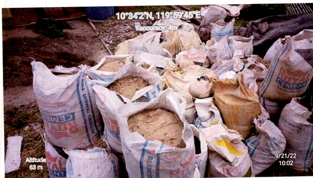
Photo 7 and 8. SAG materials utilized for the production of hollow blocks owned by Mr. Joey Escubin.