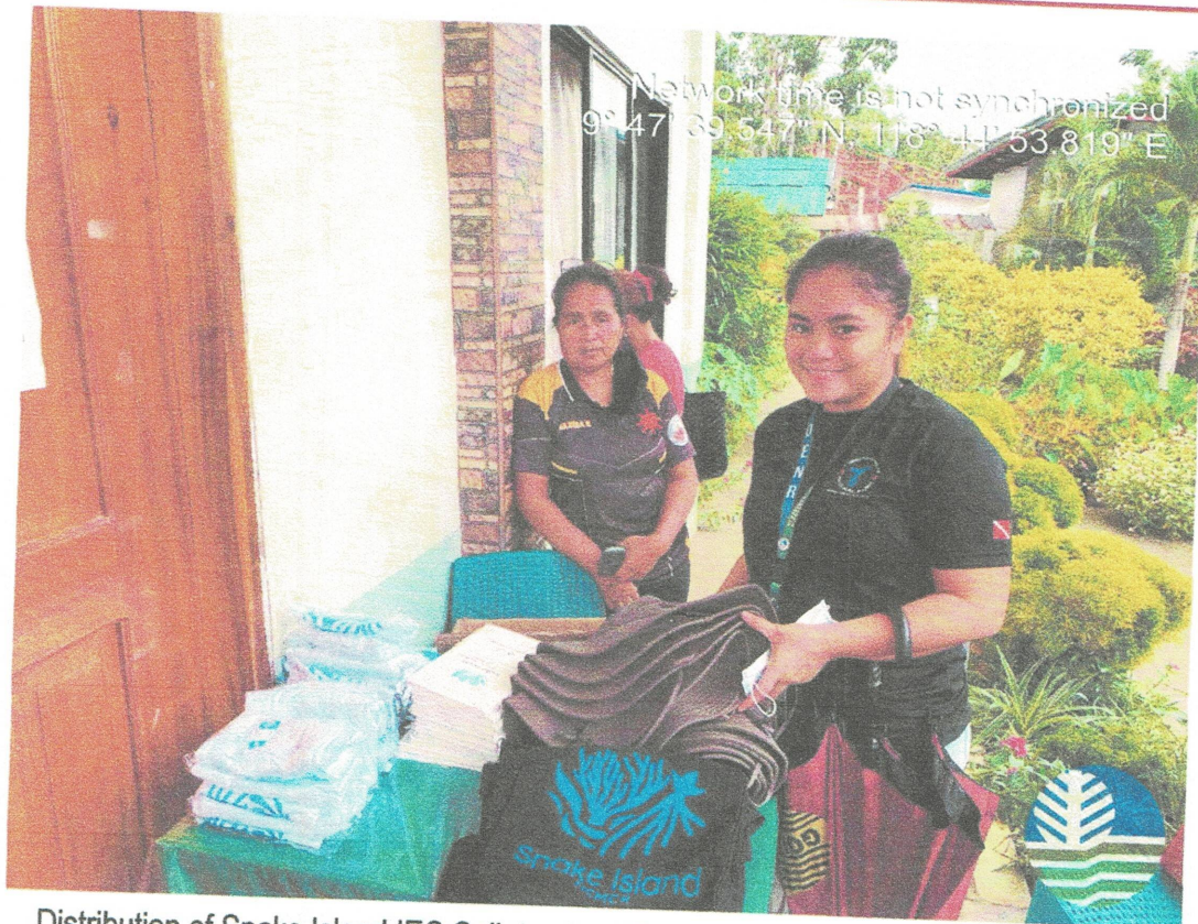
Distribution of Snake Island IEC Collaterals at Barangay San Jose, Puerto Princesa City

Telfax No. (048) 433-5638 / (048) 433-5638