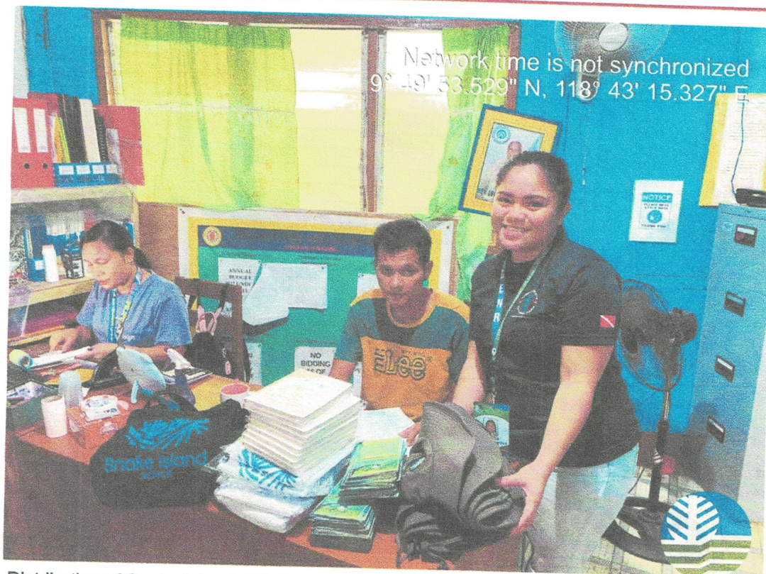
Distribution of Snake Island IEC Collaterals at Barangay Sta. Lourdes, Puerto Princesa City

Telfax No. (048) 433-5638 / (048) 433-5638