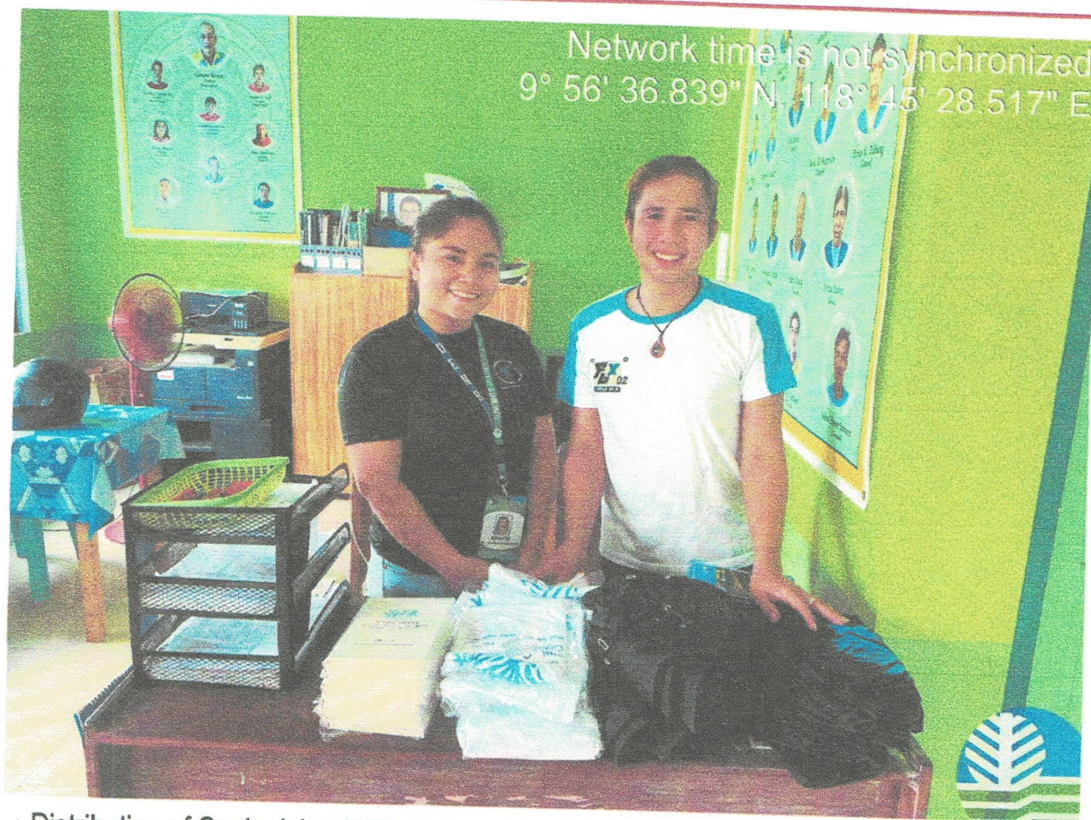
Distribution of Snake Island IEC Collaterals at Barangay Sta. Cruz, Puerto Princesa City

Telfax No. (048) 433-5638 / (048) 433-5638