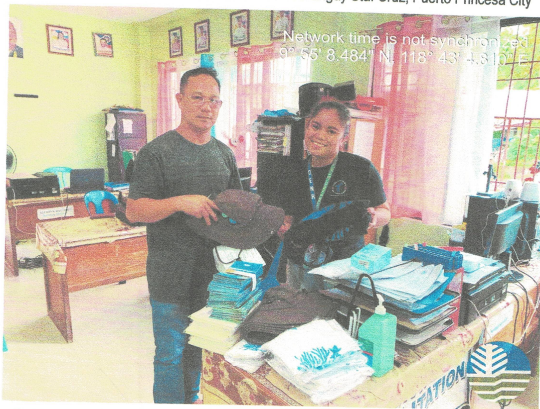
Distribution of Snake Island IEC Collaterals at Barangay Bacungan, Puerto Princesa City

Bgy. Sta. Monica, Puerto Princesa City, Palawan