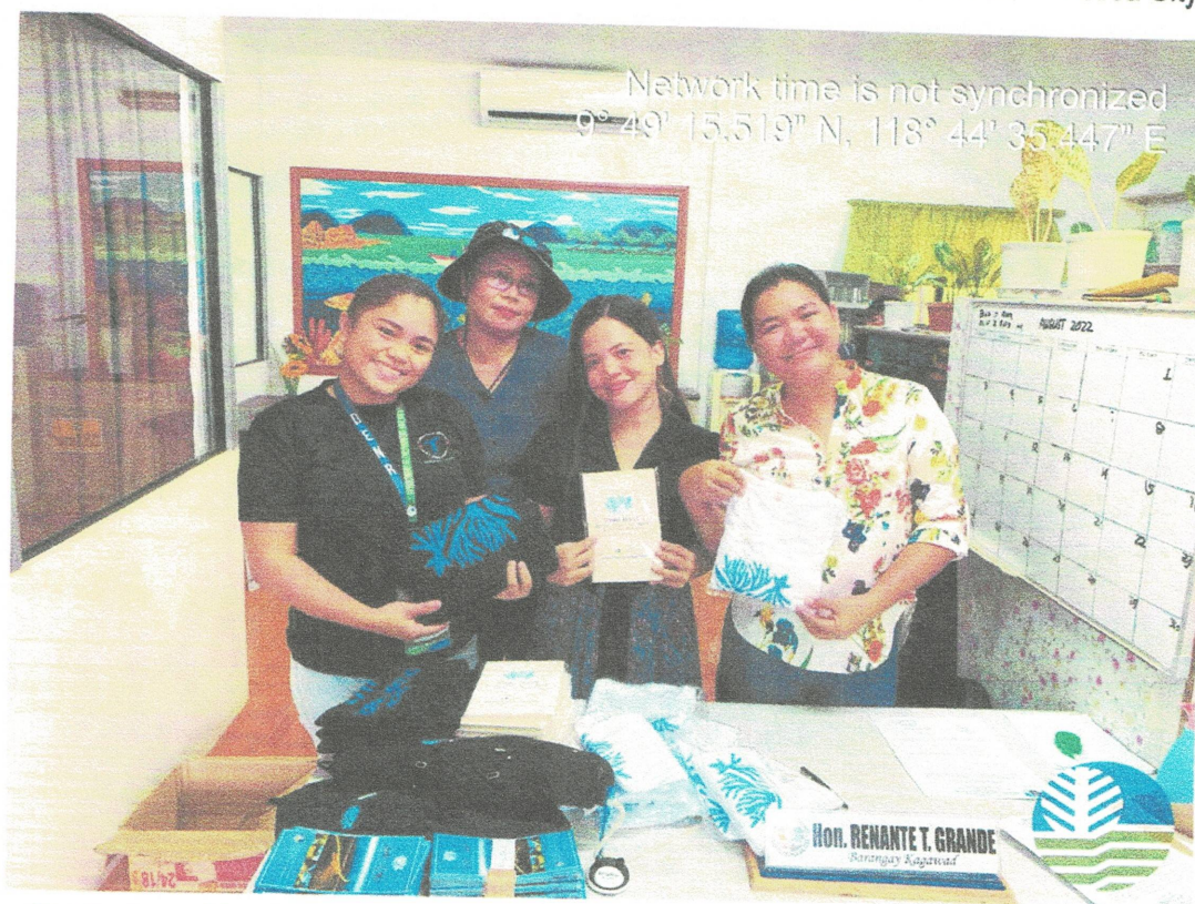
Distribution of Snake Island IEC Collaterals at Barangay Tagburow, Puerto Princesa City

Bgy. Sta. Monica, Puerto Princesa City, Palawan