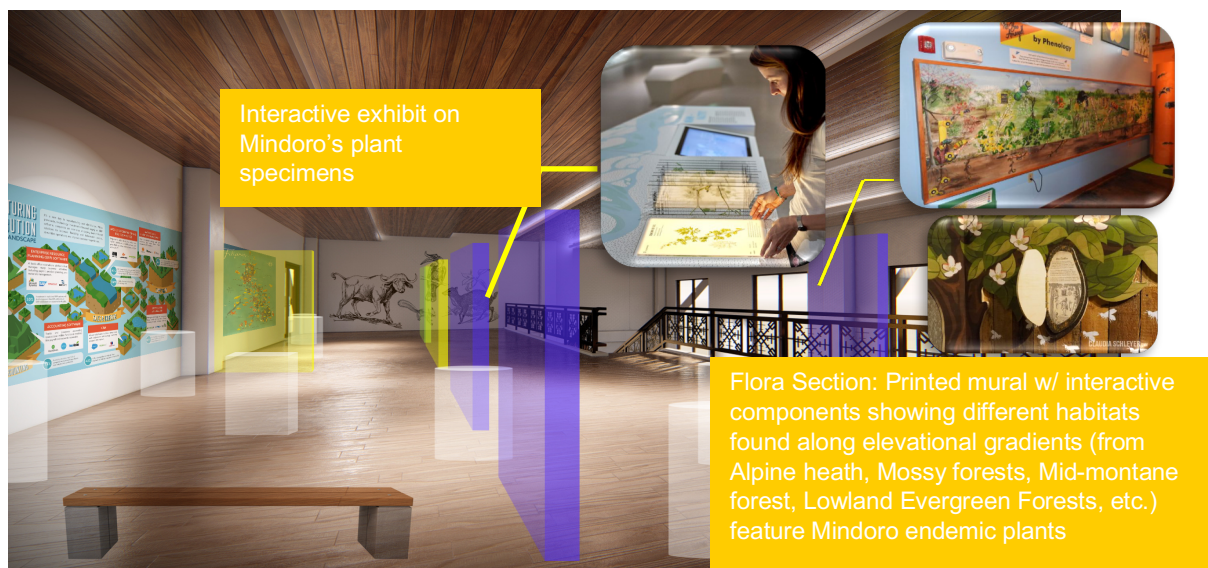
Figure 3. Flora