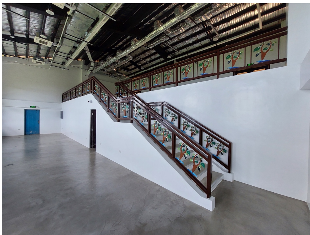
Figure 2. Area for the museum