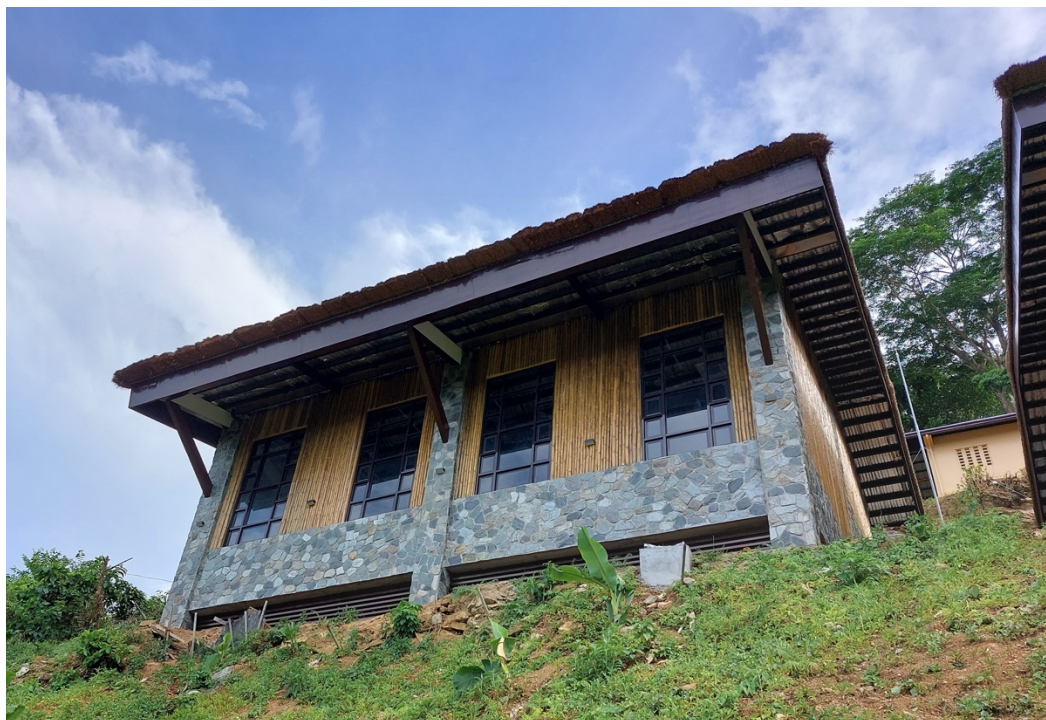
Figure 1. Building 2 of MBCC where the museum is located