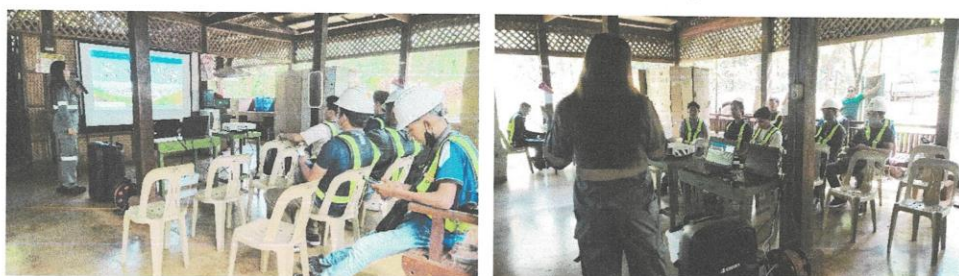
IEC/ Orientation at CBNC

M. Rodriguez St. Poblacion District I, Brooke's Point Palawan 5305 Tel No: (048) 726-4101 Mobile Phone: Globe: 09175028961 Email/Gmail: cenro_brkspt@yahoo.com; cenrobrookespoint@denr.gov.ph