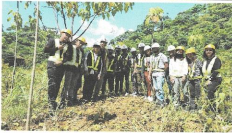
Tour at Gotok Limestone Quarry