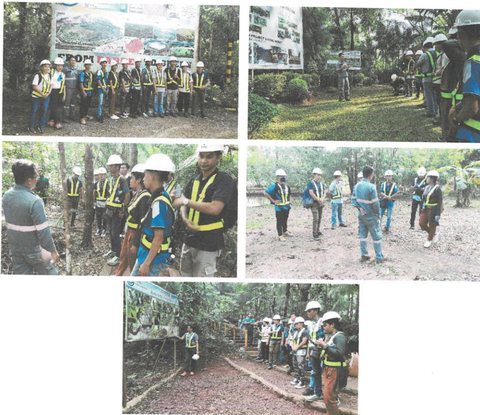
Tour at Tailings Storage Facility 1 Rehabilitation Area and Bamboo Setum