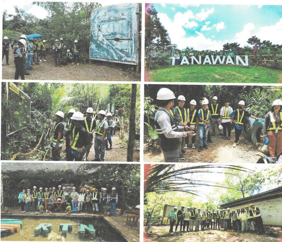
Tour at Mangingidong Ecosystem Restoration Laboratory