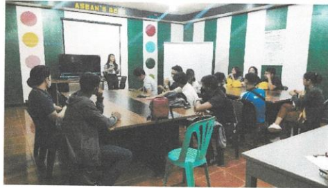
Short IEC/ Orientation at RTNMC