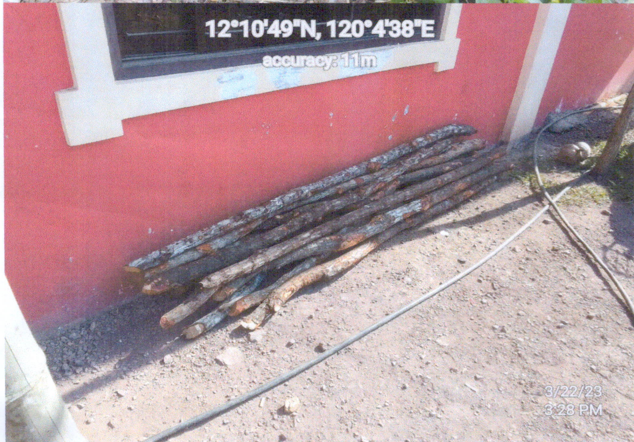
Geo-tagged photos of apprehended mangrove timber A A 78