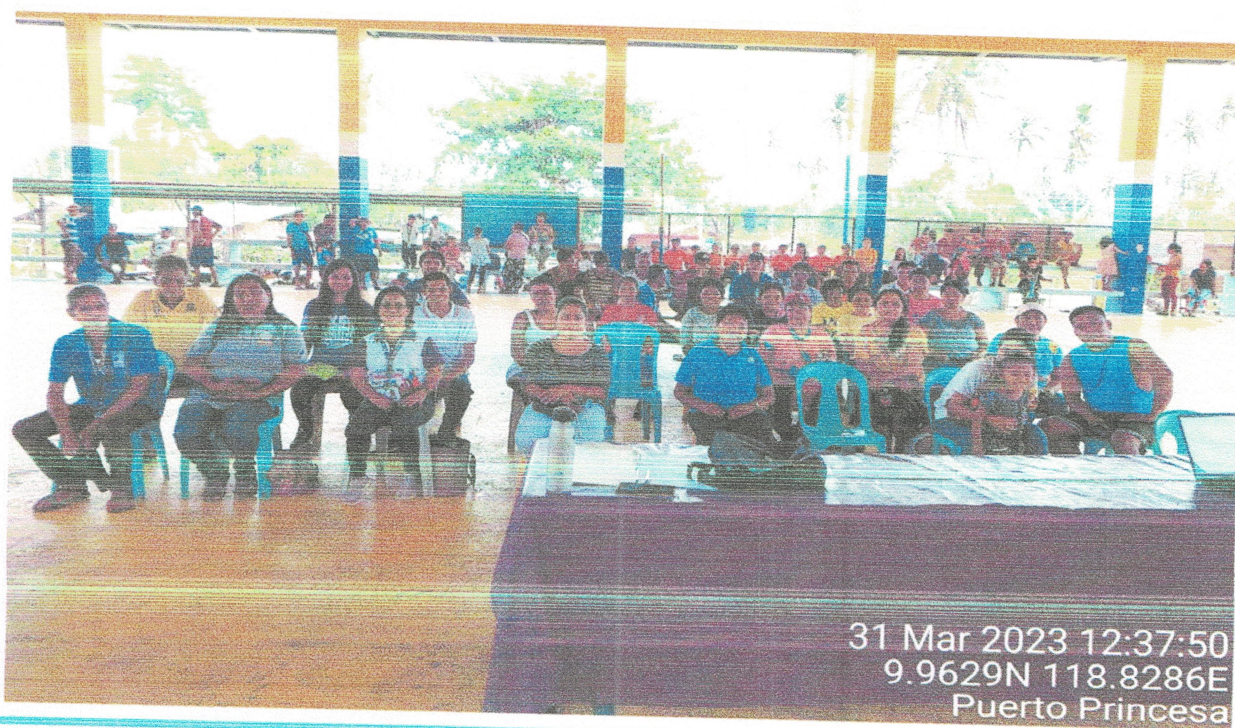
Group picture with the fisherfolks.