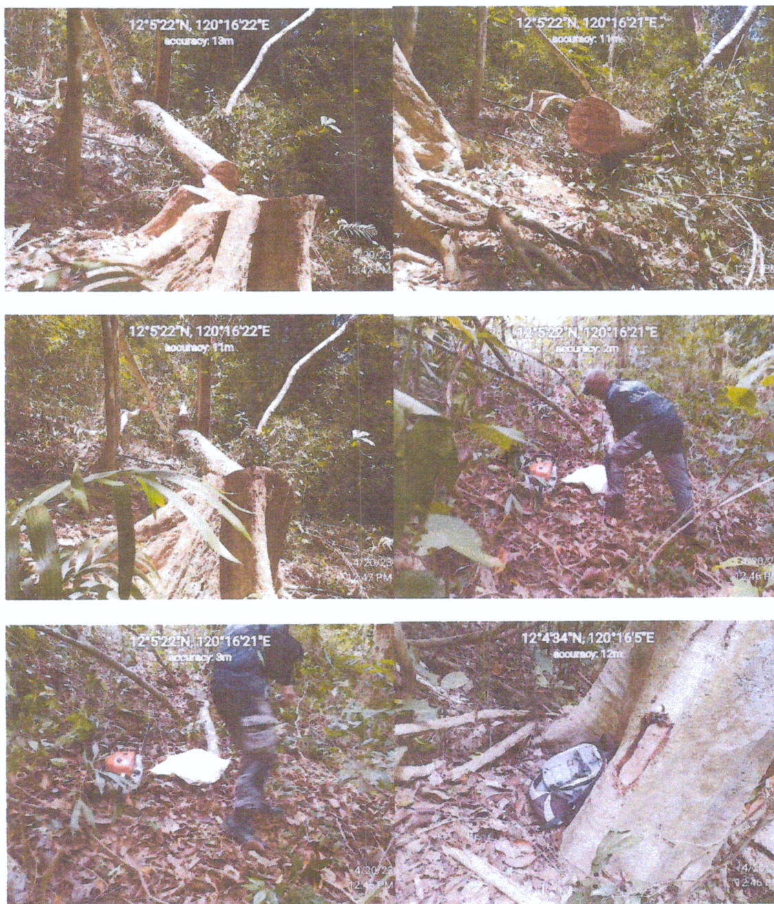
GEO-TAGGED PHOTO OF THE APPREHENDED CHAINSAW