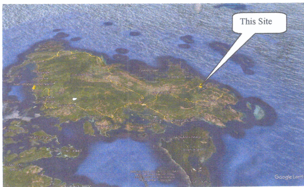
Location site of apprehended chainsaw

Calamianes Island, Coron, Palawan Email address: cenro_coron@yahoo.com