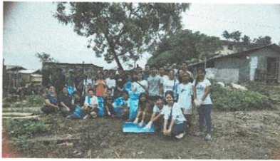
Coastal clean-up held on July 28, 2023 at Old Pier, Sitio Marabahay, Barangay Rio Tuba, Bataraza, Palawan