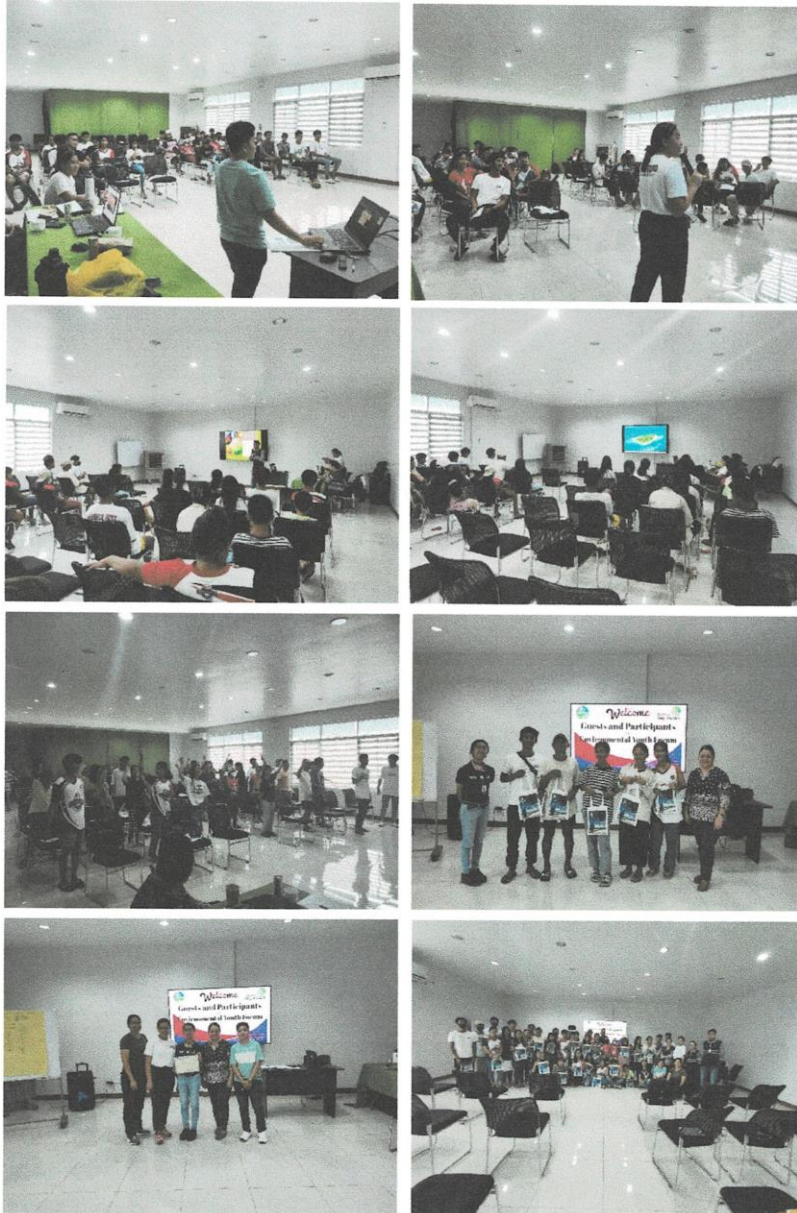
Environment Youth Forum held on July 27, 2023 at RTNMC Training Center

M. Rodriguez St. Poblacion District I, Brooke's Point Palawan 5305 Tel No: (048) 726-4101 Mobile Phone: Globe: 09175028961 Email/Gmail: cenro_brkspt@yahoo.com; cenbrookespoint@denr.gov.ph