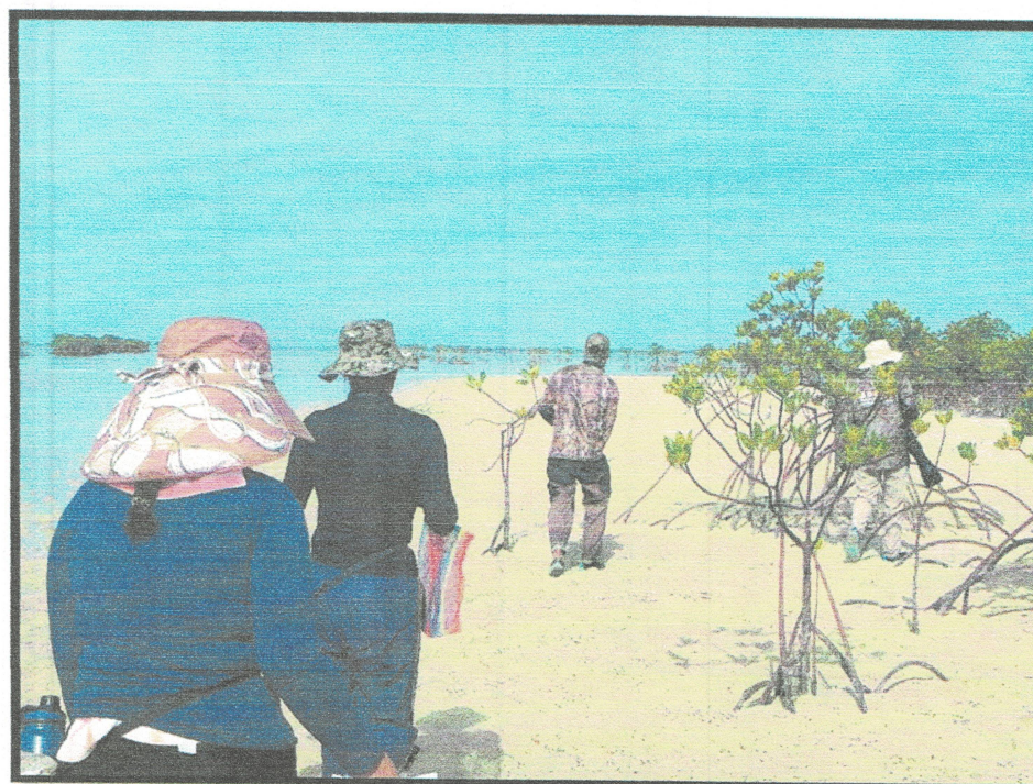
Monitoring team in the Southern part of Snake Island NCMCR