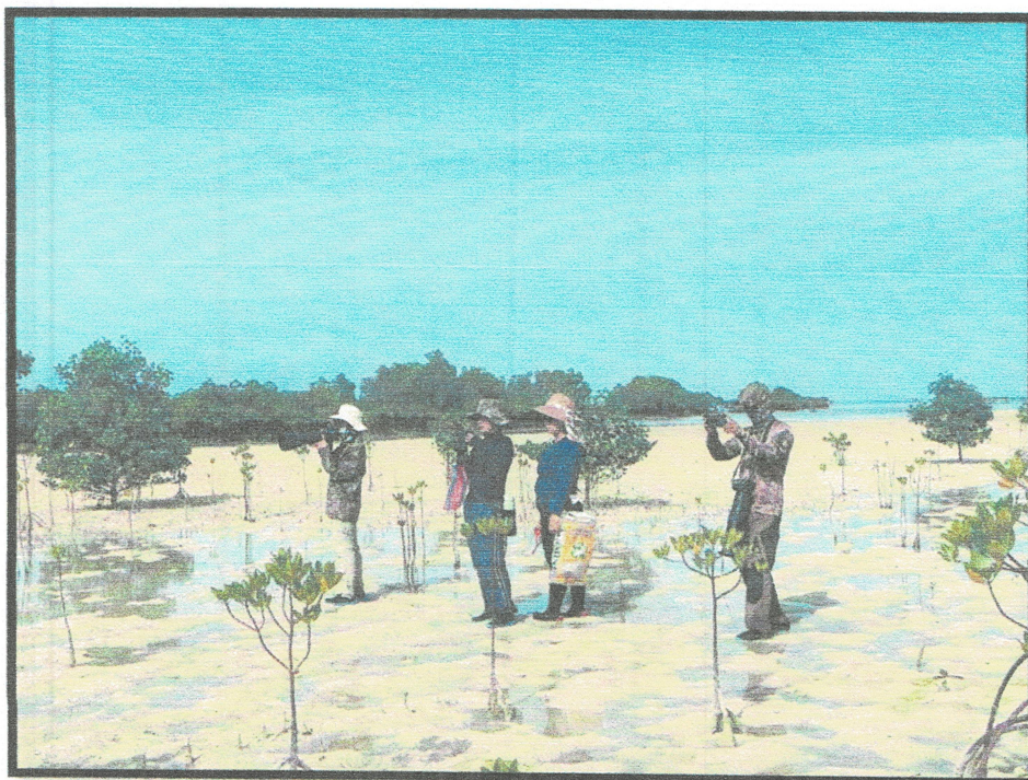
Waterbirds Monitoring Team in the Helipad of Snake Island NCMCR