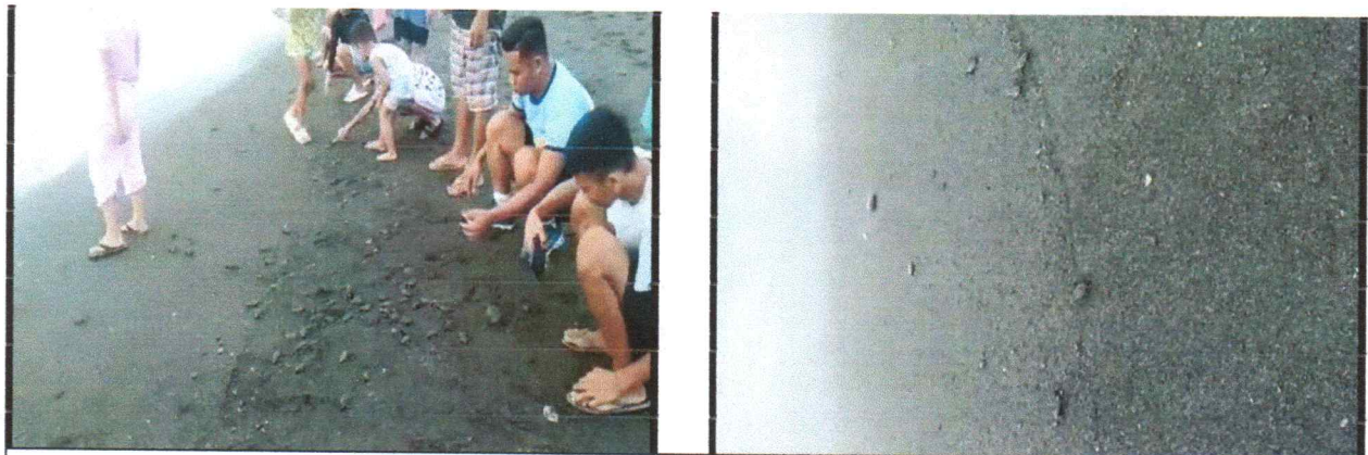
Releasing of ninety hatchlings of Green Sea Turtle in the coastal waters of Barangay Masiga, Gasan, Marinduque.