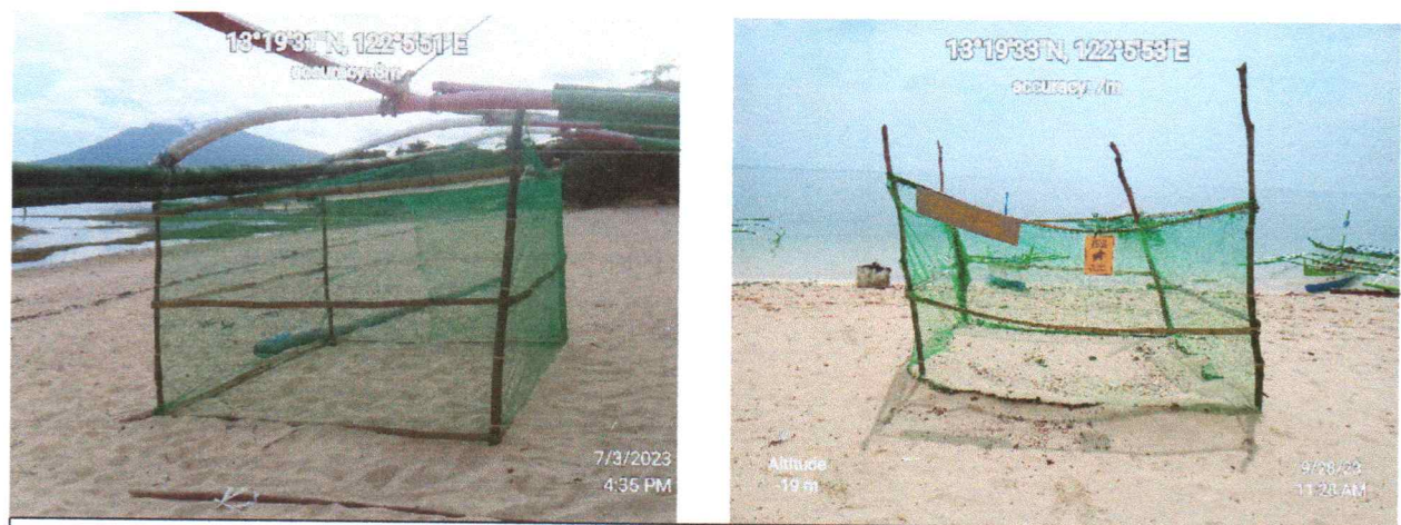
Nesting sites at White Beach, Poctoy, Torrijos