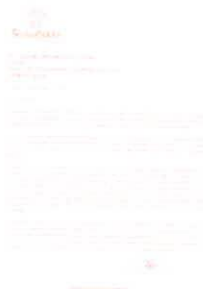
DENR Secretary letter.jpeg 194K