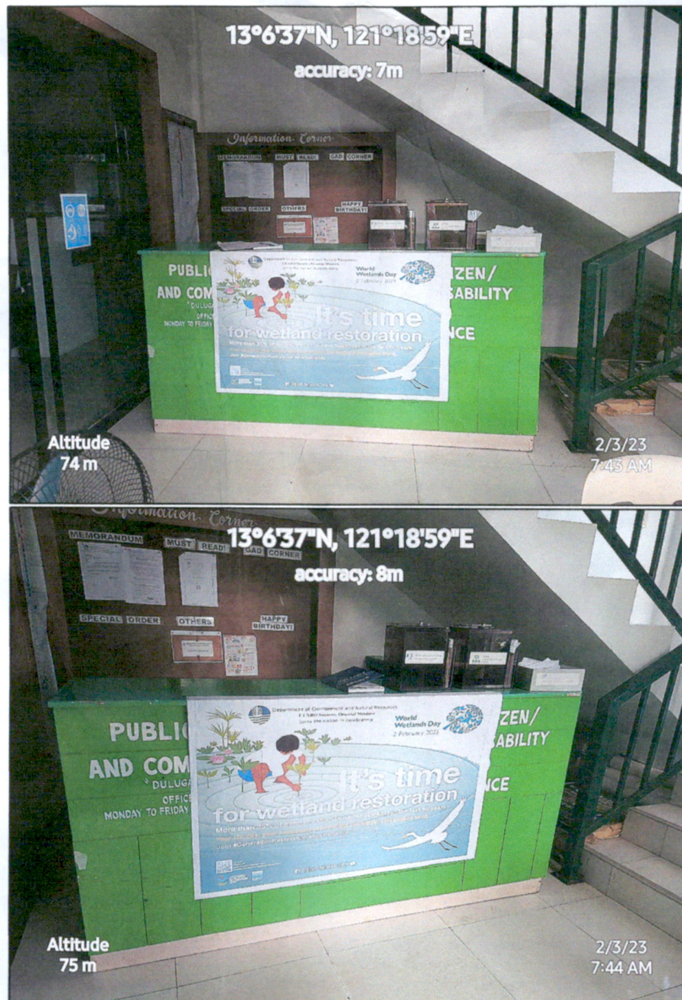
Figure 1. Production and installation of digital design/ banner in the information desk of DENR-CENRO Socorro, Oriental Mindoro in celebration of the World Wetlands Day 2023.