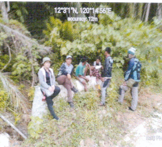
GEO-TAGGED PHOTOS TAKEN IN THE AREA