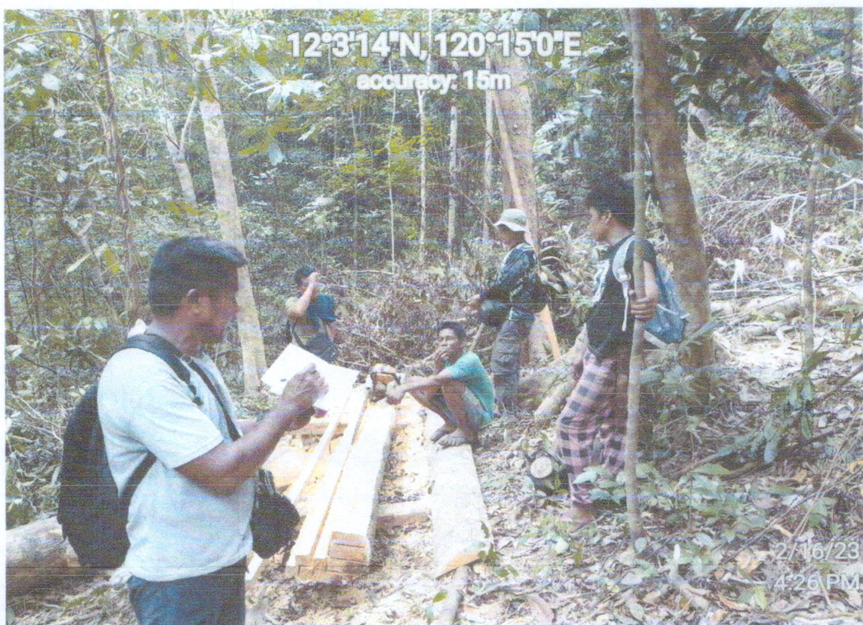
GEOTAGGED PHOTOS TAKEN DURING THE APPREHENSION IN SITIO ALUNAT BGY. BORAC CORON PALAWAN ON FEBRUARY 16, 2023