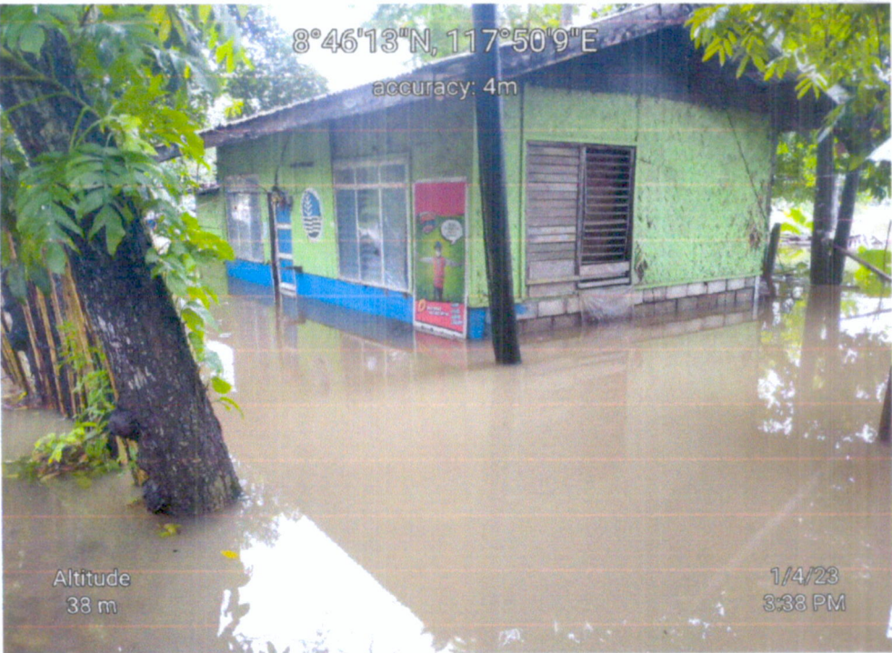
LADA PATROL BASE STATION