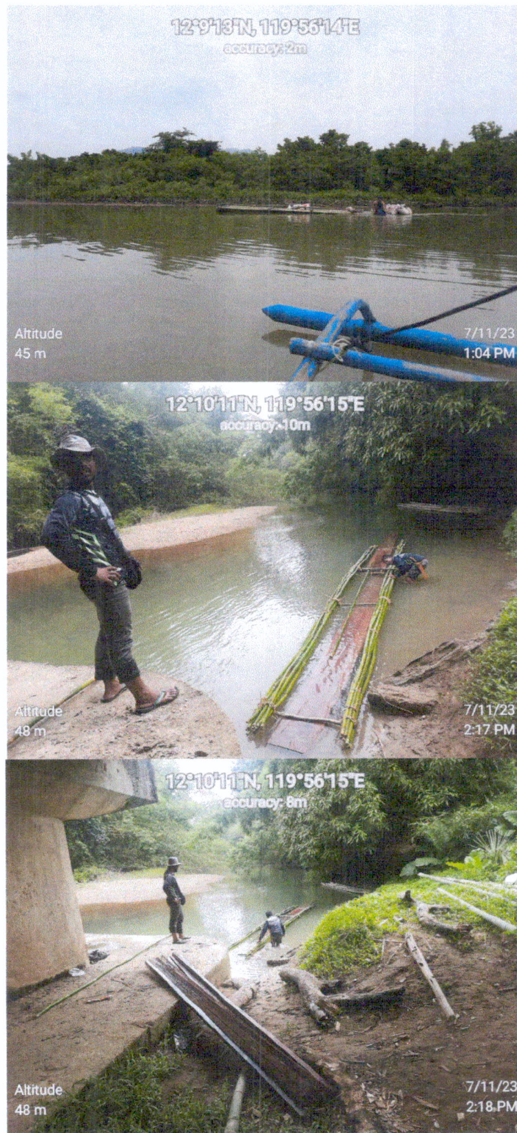
Geotag photos during of the apprehension of abandoned eight (8) pieces sawn Balinghasai (An-an) lumbers at Sitio Banaba, Barangay Old Busuanga, Busuanga, Palawan on July 11, 2023