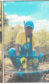
Photos above showing the CENRO personnel together with LGU- Barangay council, DMCI and CMDC representatives during the tree planting activity for the celebration of Arbor Day 2023.