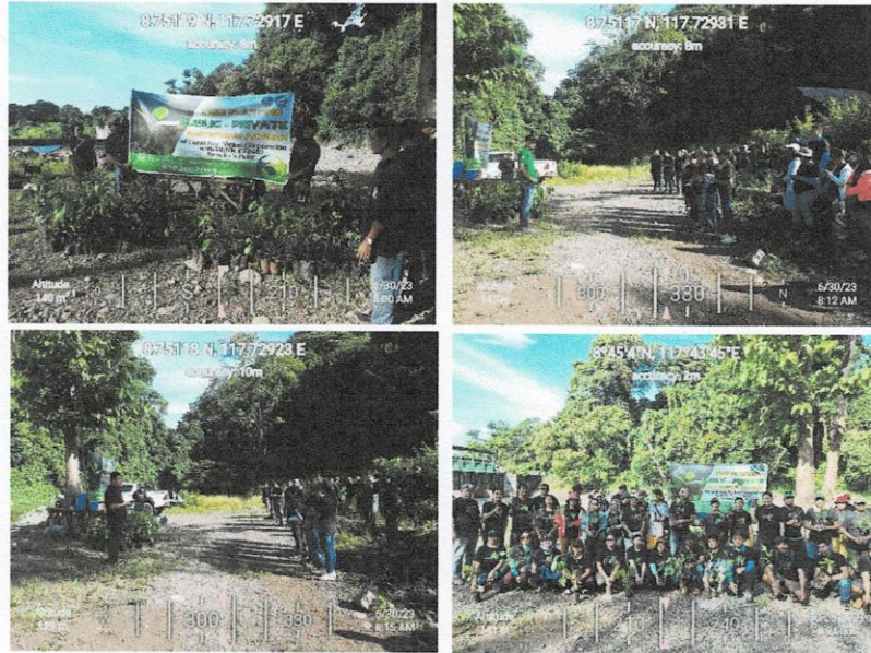
Tree Planting at Sitio Tamlang, Barangay Samariniana, Brooke's Point, Palawan