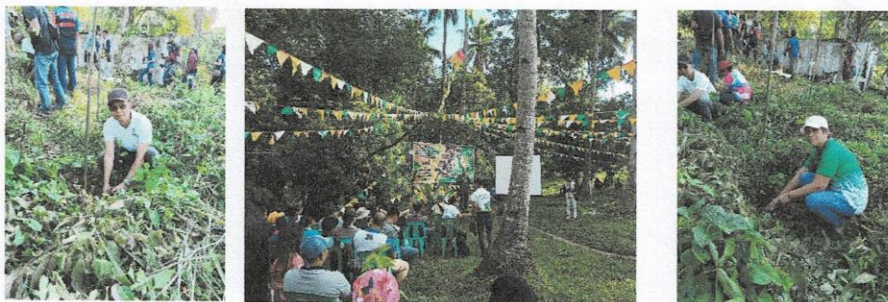
Tree planting at Barangay Amas, Brooke's Point, Palawan