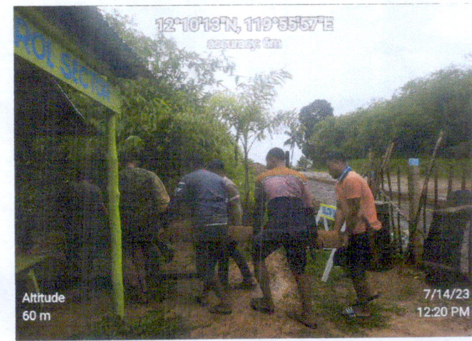
Geotagged pictures showing the hauling activity of apprehended abandoned sawn lumbers at Sitio Balitbitin, Barangay New Busuanga, Busuanga, Palawan