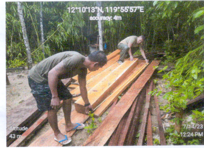
Geotagged pictures showing the scaling activity of apprehended abandoned sawn lumbers at Sitio Balitbitin, Barangay New Busuanga, Busuanga, Palawan