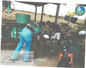
CENR Office Taytay