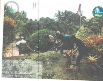
Protected Area Management Office- MSPLS