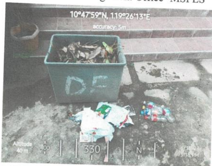
Protected Area Management Office- ENMRPA