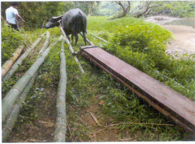
Geotagged pictures showing the hauling activity of apprehended abandoned sawn lumbers at Sitio Banaba, Barangay Old Busuanga, Busuanga, Palawan