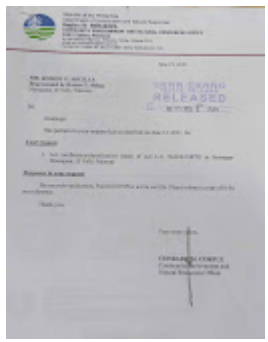
Reply of CENRO DENR Mimaropa.jpg 155K