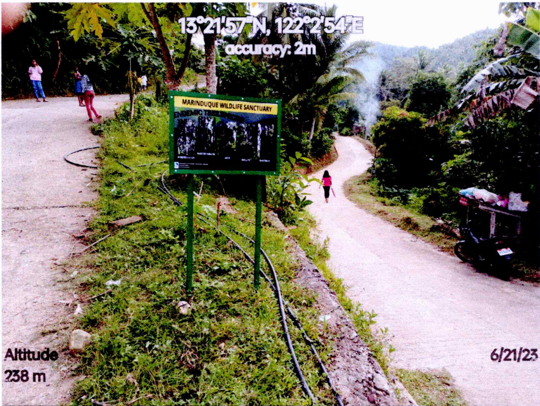
Geotagged photo of interpretive signage ( ENDEMIC TREE SPECIES ) installed at Brgy. Nangka, Torrijos, Marinduque.