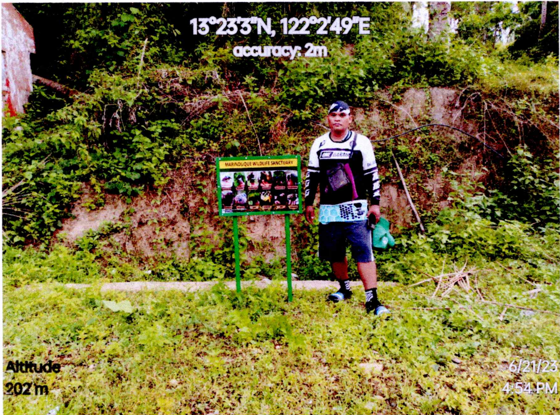
Geotagged photo of interpretive signage ( BIRDS SPECIES WITHIN MWS) installed at Brgy. Tambangan, Sta. Cruz, Marinduque.