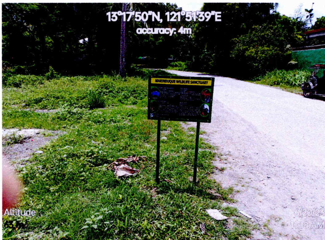
Geotagged photo of interpretive signage ( FACTS ABOUT FEATURED FAUNA SPECIES) installed at Brgy. Sihi, Buenavista, Marinduque.