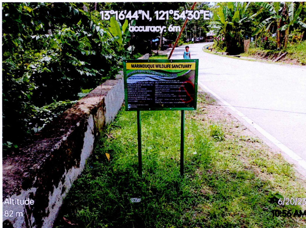
Geotagged photo of interpretive signage ( PROHIBITED ACTS UNDER R.A. 11083) installed at Brgy. Antipolo, Gasan, Marinduque