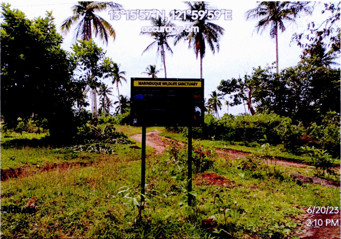
Geotagged photo of interpretive signage ( FACTS ABOUT FEATURED FAUNA SPECIES) installed at Brgy. Sihi, Buenavista, Marinduque.