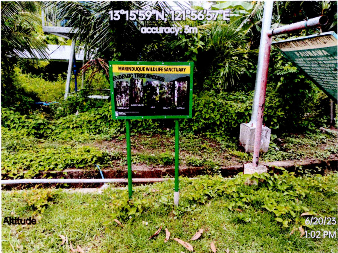
Geotagged photo of interpretive signage (ENDEMIC TREE SPECIES) installed at Brgv. Malbog, Buenavista, Marinduque.