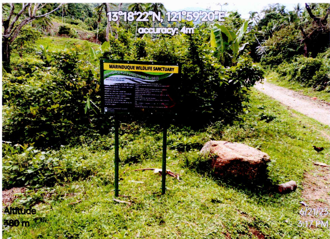
Geotagged photo of interpretive signage ( PROHIBITED ACTS UNDER RA 11083) installed at Brgy. Tambunan, Boac, Marinduque.