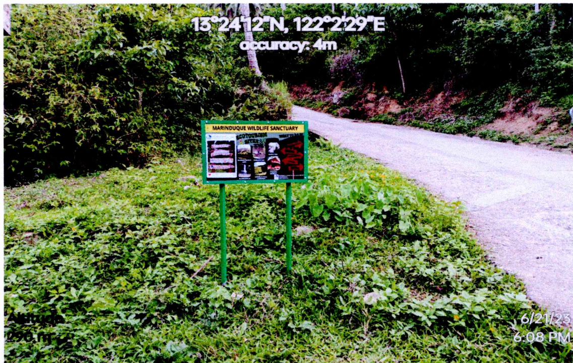
Geotagged photo of interpretive signage ( BIRDS SPECIES WITHIN MWS) installed at Brgy. Masalukot, Sta. Cruz, Marinduque.