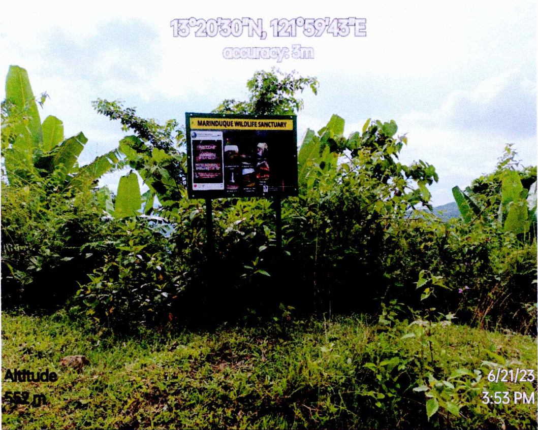
Geotagged photo of interpretive signages ( ECOTOURISM SITES) installed at Brgy. Tumagabok, Boac, Marinduque.