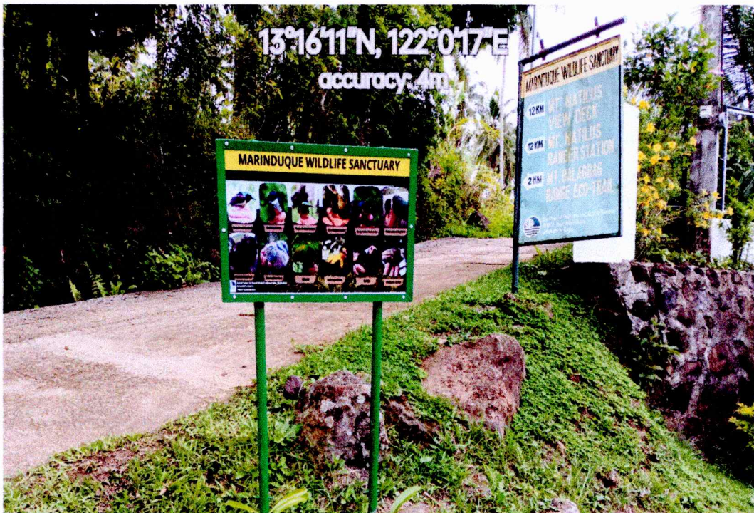
Geotagged photo of interpretive signage ( BIRDS SPECIES WITHIN MWS ) installed at Brgy. Malibago, Torrijos, Marinduque.