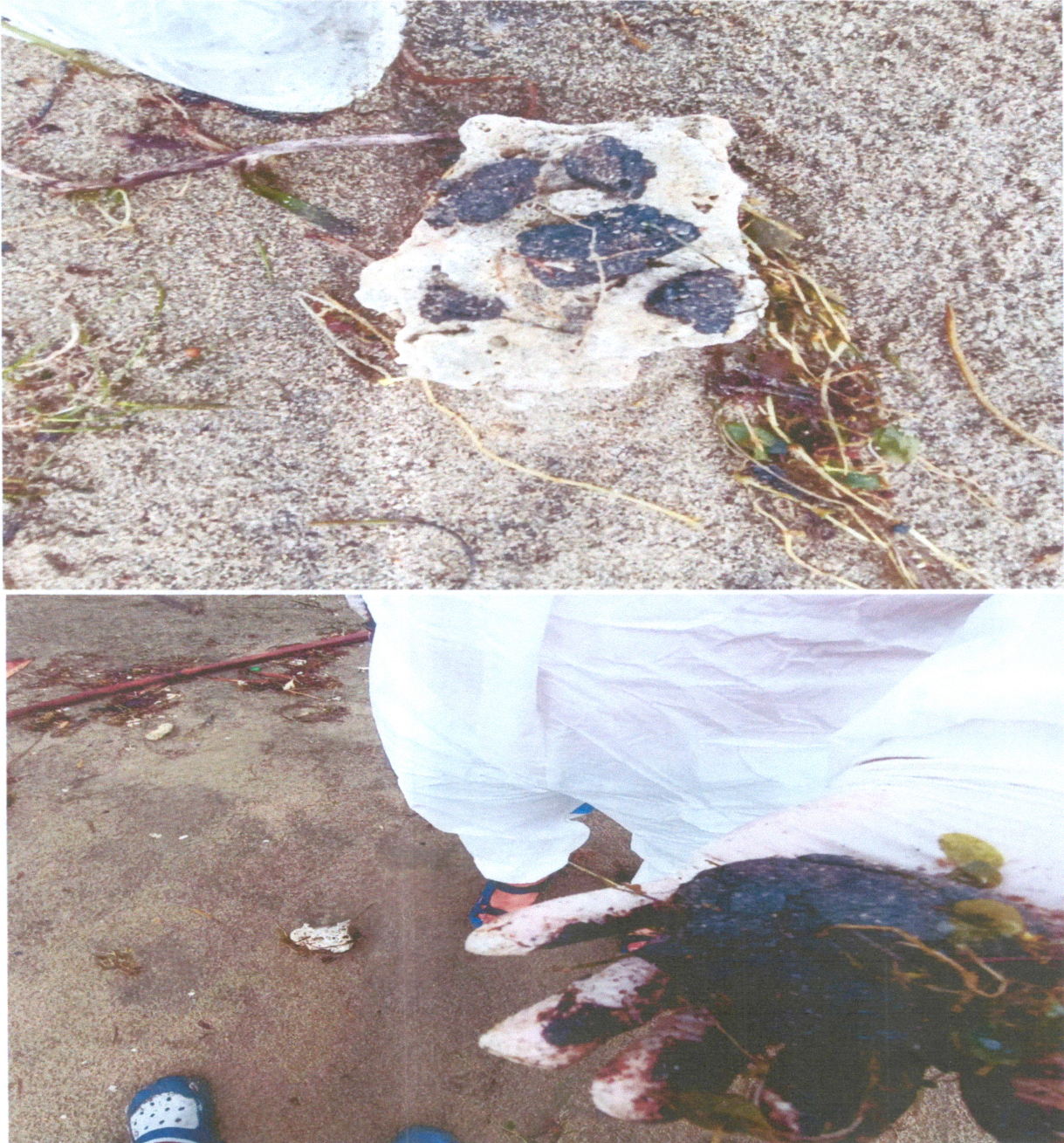
PHOTOS OF THE COLLECTED SOLIDIFIED OIL AND DEBRIS LOCATED IN THE MUNICIPALITY OF SAN ANDRES, ROMBLON

Republic of the Philippines Department of Environment and Natural Resources MIMAROPA Region