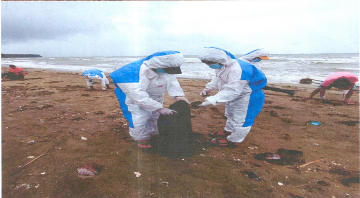
GEOTAG PHOTOS DURING THE COLLECTION OF THE SOLIDIFIED OIL BY THE PHILIPPINE COAST GUARD OF TABLAS ISLAND LOCATED IN THE MUNICIPALITY OF SAN ANDRES, ROMBLON