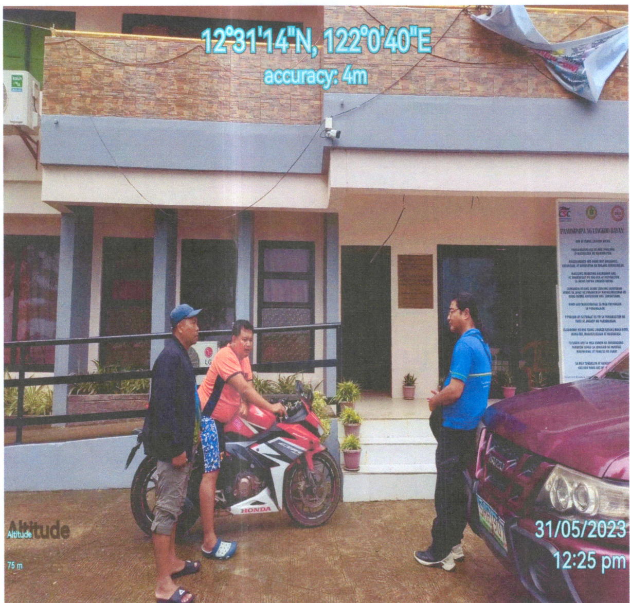
DURING THE COORDINATION OF THE MONITORING AND ENFORCEMENT SECTION, ENVIRONMENTAL MANAGEMENT SERVICES AND PHILIPPINE COAST GUARD PERSONNEL TO THE OFFICE OF THE MUNICIPAL DISASTER RISK REDUCTION OFFICE OF SAN ANDRES, ROMBLON