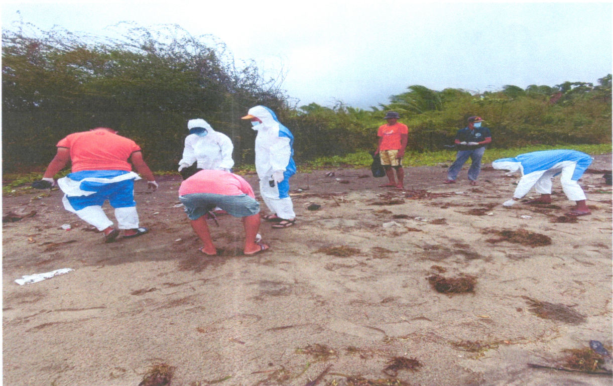
GEOTAG PHOTOS DURING THE COLLECTION OF THE SOLIDIFIED OIL BY THE PHILIPPINE COAST GUARD AND SAN ANDRES MUNICIPAL POLICE STATION OF TABLAS ISLAND LOCATED IN THE MUNICIPALITY SAN ANDRES, ROMBLON