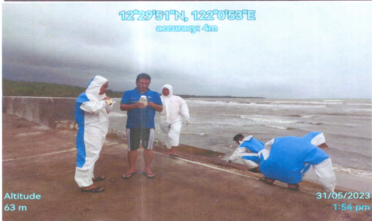
DURING THE COLLECTION OF WATER SAMPLE LOCATED IN THE MUNICIPALITY OF SAN ANDRES, ROMBLON