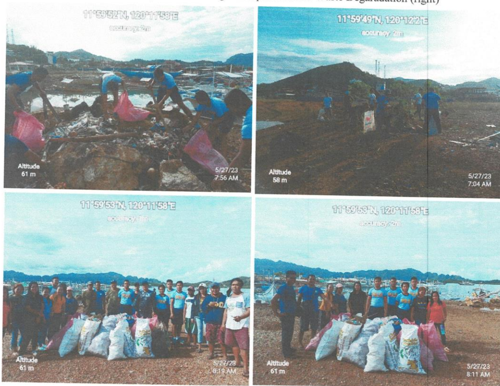
Photos during clean-up in-action (upper) photo opt with participants and collected garbages (lower)