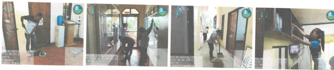
Protected Area Management Office- MSPLS