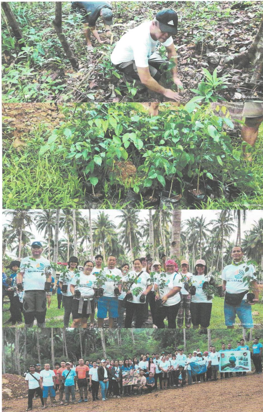
A total of 150 Narra seedlings were planted by 70 individuals (37 male/33 female) composed by the students and faculty of CTSHS-SA Philippine Coastguard (PCG), 401 st B MC, RMFB, DENR CENRO Taytay-El Nido and SAMAGMANALIYA held at Sitio Batas, Poblacion, Taytay, Palawan on June 5, 2023 in observance of World Environment Day.