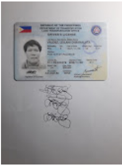
ID Lann Valdez.jpg 66K