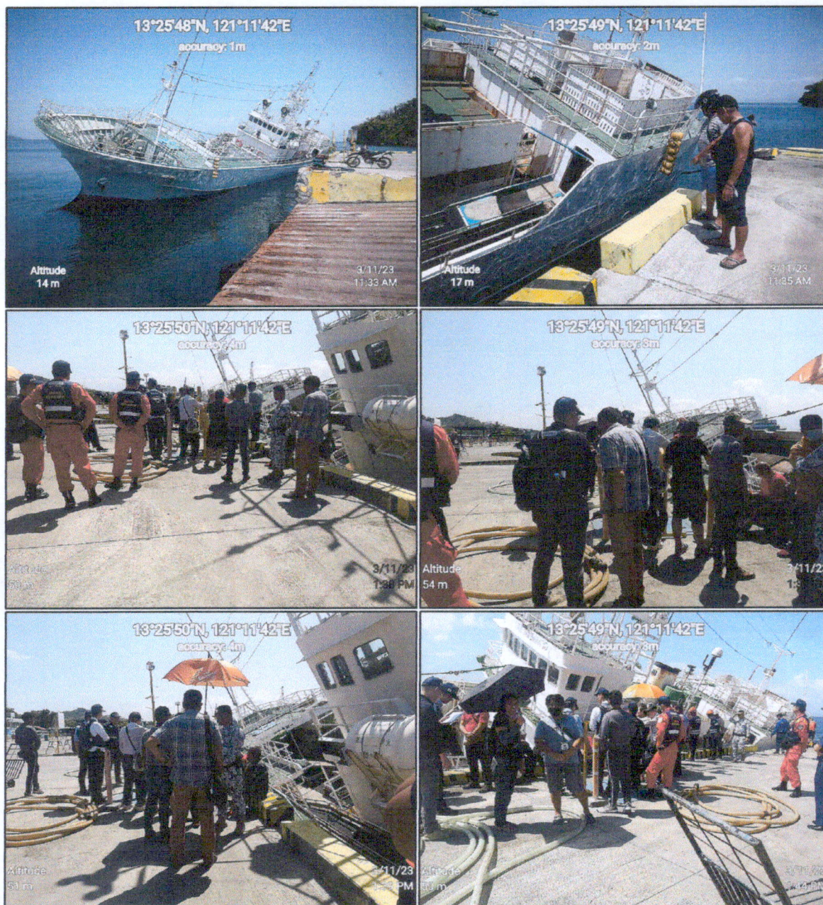
Figure 4. Inspection and monitoring of MV Catriona maritime incident.