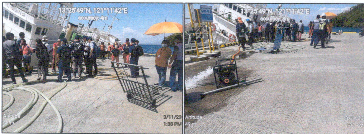
Figure 2. Pumping of uncontaminated water out of the vessel.