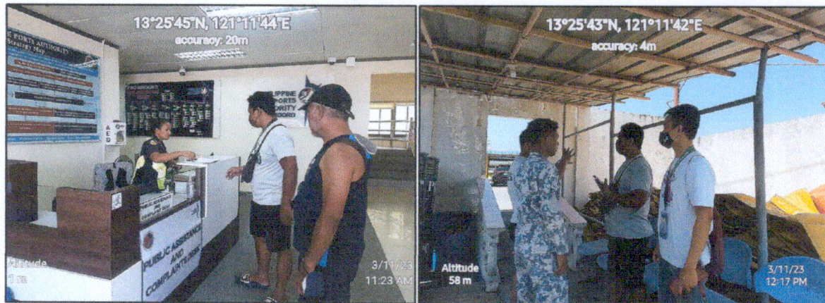
Figure 1. Coordination with the PPA and PCG regarding the MV Catriona maritime incident.