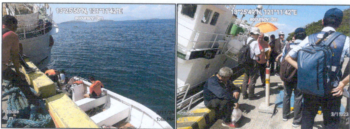
Figure 3. PCG inspecting the damage of MV Catriona.