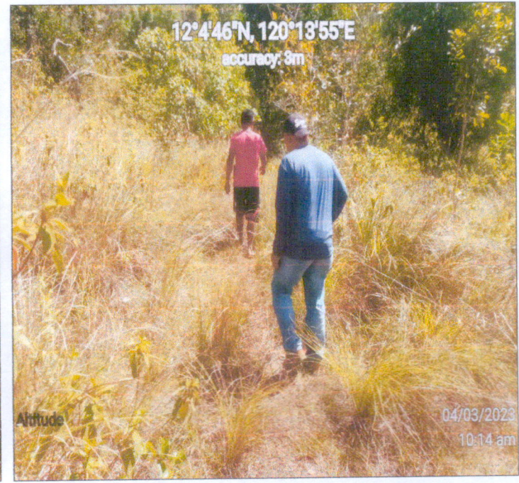
Photos taken during the identification of fire prone areas at So. Bantad, Barangay San Nicolas, Coron, Palawan