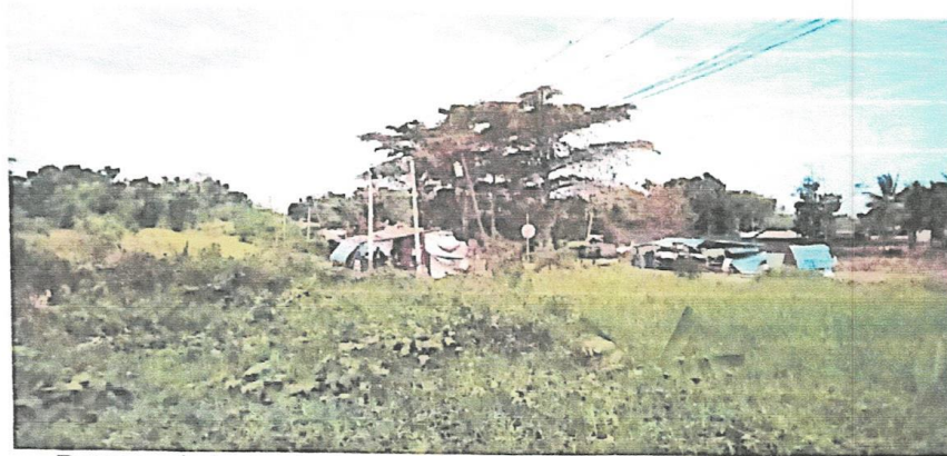
Temporary sheds set-up by the group of protesters in front of the Office of Ipilan Nickel Corporation