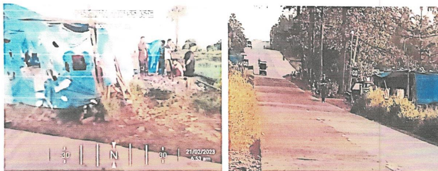
Status in the area as of 7:00 AM, February 21, 2023