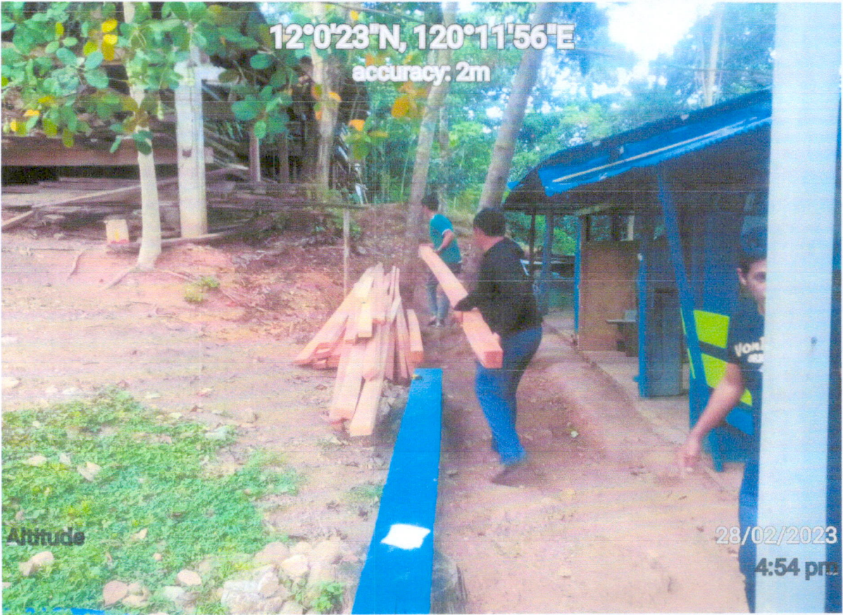
Geotagged photos show the BPR personnel unloading of apprehended 35 pieces of lumbers

A handwritten signature in black ink, consisting of a stylized 'A' followed by a horizontal line.