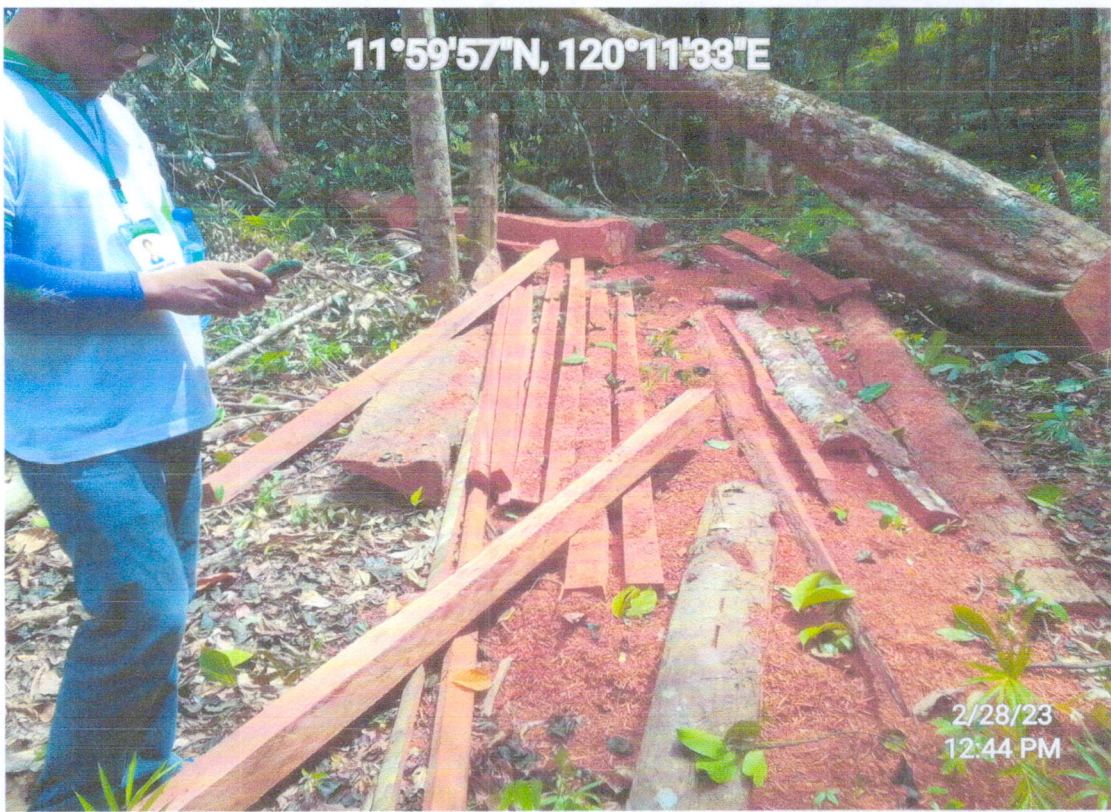
Geotagged photos of the apprehended Thirty five (35) pieces of lumbers with a total volume of 412.67 board feet