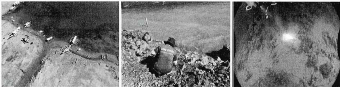
(Dumped seagrass beds and coral reefs; siltation)

But the illegal reclamation issue was only the tip of the iceberg. During the investigation, we have seen the perennial concerns in the municipality that hinder the inception of rehabilitation as they are interconnected and must be addressed systematically. The CBDP has started without critical requisites and due diligence resulting in artificial land of inferior quality that has a high risk of liquefaction and subsidence. Mitigating measures that should have been done during the dumping activity and abandonment phase were not instituted causing severe harm to the marine ecosystems and exacerbating the decades-old water pollution problem. The lack of a proper drainage system, sewage treatment plant and silt traps worsens the waste generation in the bay. Coastal flooding that prompted emergency evacuations and superficial solutions is a common sight during typhoons. Illegal and unregulated mountain and river quarry activities are widespread resulting in the theft of minerals, flash floods, landslides, soil erosion, and numerous illegal reclamations, while the resettlement issues and illegal occupation of forestlands and easement zones have been unresolved for years. There are government infrastructure projects built in environmentally critical areas that despite the issuance of Notices of Violation and Cease-and-Desist-Orders by the DENR due to lack of environmental permits, act with impunity prevails.