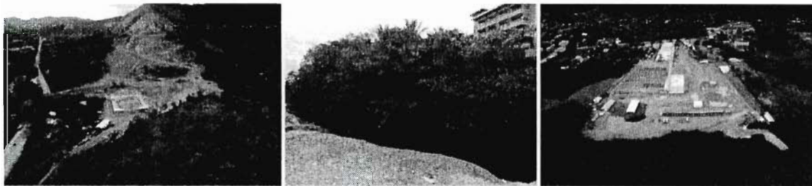
(Illegal mountain quarry; dumped mangrove forest)

In spite of all these alarming concerns that are hidden in the "one of the top tourist destinations" label of Coron, it is proven that its natural and incomparable beauty surpasses its flaws but the distinct quality of this island will diminish in time if the continued assault on the environment thrives. The pristine landscape and seascape are the main drivers for economic growth but people have an insatiable hunger for more than nature can offer. People who are money-driven abuse fragile ecosystems while most of the residents are silent on the rampant destruction of nature. This town puts too much weight on materialism by exploiting the natural resources irresponsibly which leads to intergenerational inequity that compromises the general welfare of future generations. This vicious cycle must be stopped as Coron is in grave peril. What each of us can do to put an end to this trend to save our remaining vital life-support systems?