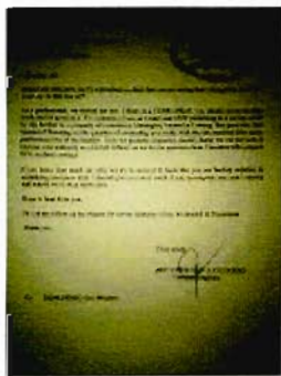
letter to C-SBY.jpeg 53K

good day, i am furnishing you my letter to the CENRO Sablayan, Occ. Mindoro for your information and record. salamat po. Pls do something. pls acknowledge receipt of this email. thank you.