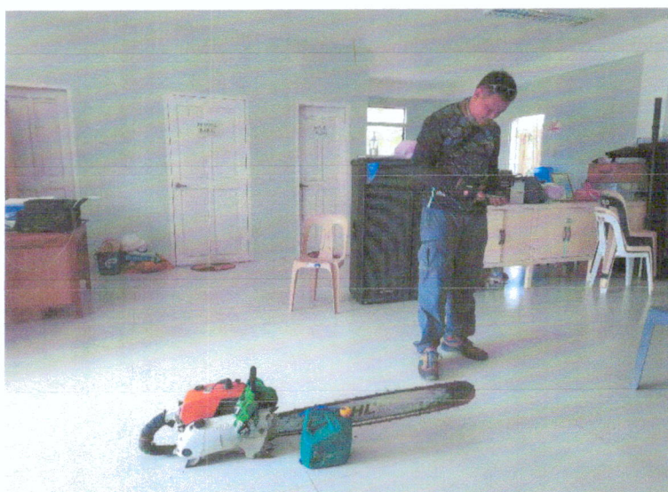
Photos show the apprehended undocumented Stihl chainsaw at Brgy. Buluang, Busuanga, Palawan