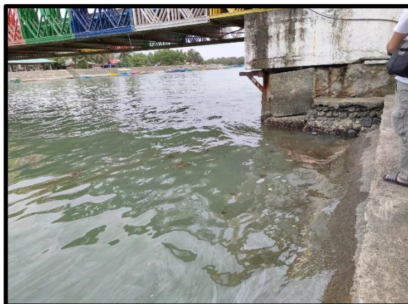
Traces of oil slick and film were observed during the inspection of the waterbodies of Pola, Oriental Mindoro