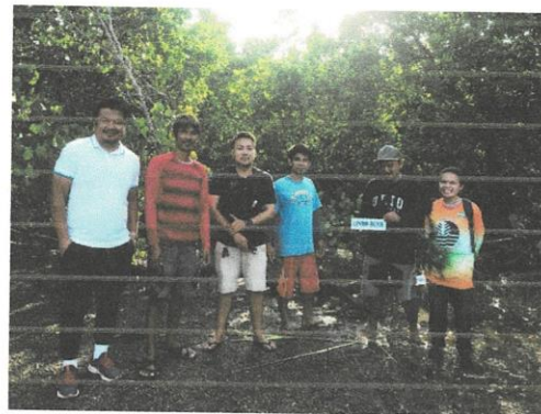
Mangrove growing at Sitio Tagusao, Barangay Barong- barong, Brooke's Point