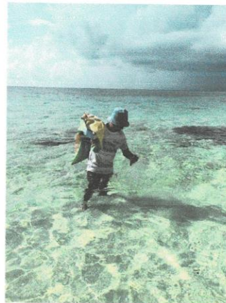
Coastal clean-up at Ursula Island Wildlife Sanctuary

M. Rodriguez St. Poblacion District I, Brooke's Point Palawan 5305 Tel No: (048) 726-4101 Mobile Phone: Globe: 09175028961 Email/Gmail: cenro_brkspt@yahoo.com; cenrobrookespoint@denr.gov.ph