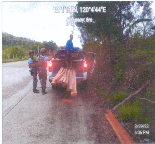
Geo-tagged photos taken during the hauling of apprehended forest product at So. Wawa, Barangay Bintuan, Coron, Palawan on March 29, 2023