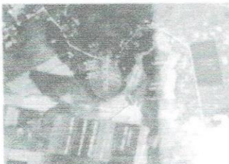
cadastral map.jpg 218K