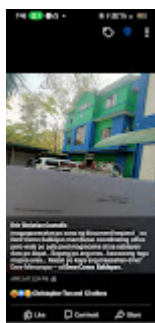
fb post april 3,2023.jpg 813K

The information contained in the communication is privileged and confidential and intended solely for the use of the individual or entity to whom it is addressed and others authorized to receive it. If you are not the intended recipient, you must not disclose or use the information contained in it. If you have received this email in error, please notify us immediately by return email and delete the document. The Action Center/Hotline is neither liable for the proper and complete transmission of the information nor for any delay in its receipt. The Action Center/Hotline accepts no liability for any damage caused by this email or its attachments due to viruses, interference, interception, corruption or unauthorized access.