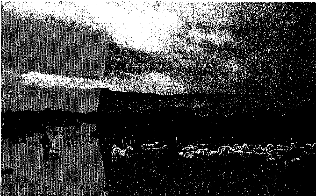
Sheep from Skyelark Ranch graze a field planted with a cover crop in Brooks, California.