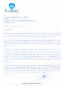
DENR Secretary letter.jpeg