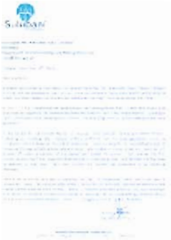
DENR Secretary letter.jpeg 194K