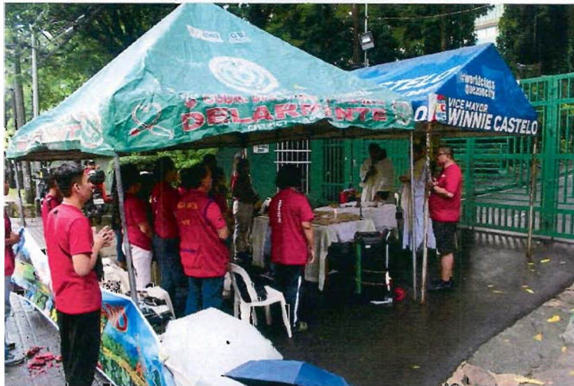
A mass and prayer vigil were conducted at the gate of DENR from October 10, 6PM to October 11, 10AM