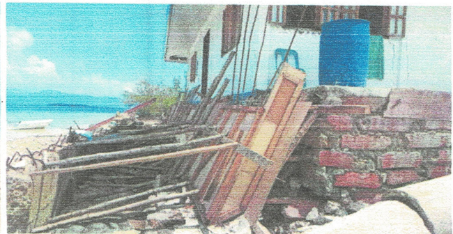
Riprap at the frontage and side area of the Monitoring Station building