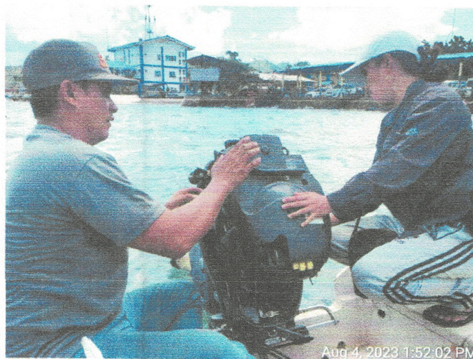
Speedboat maintenance on July 30, 2023 and August 4, 2023