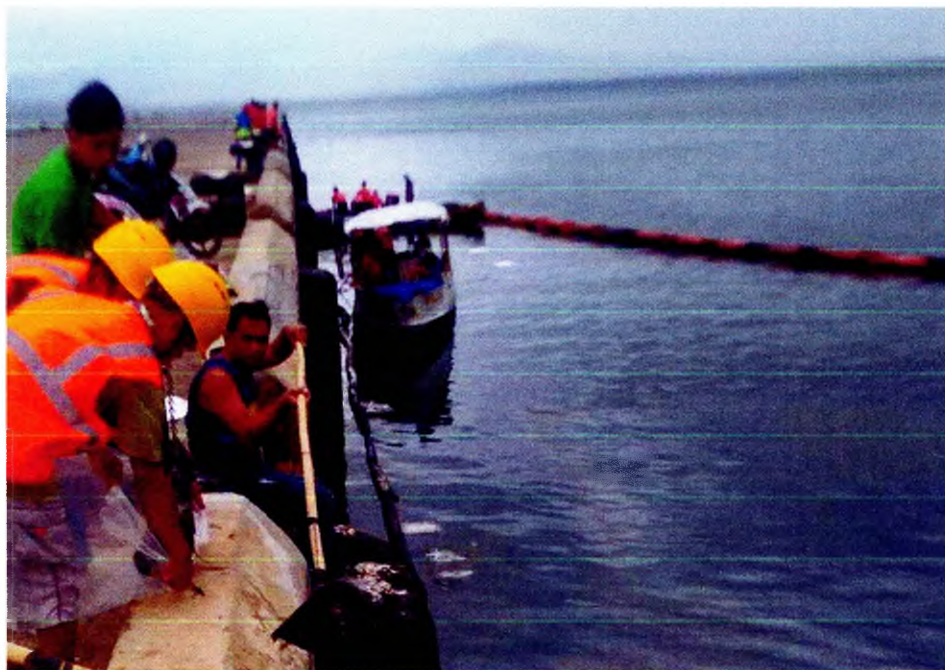
PPA personnel assisting in the retrieval of oiled absorbent pads