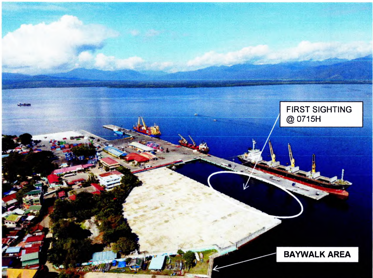
Aerial view of the port showing the first sighting of the oil spill