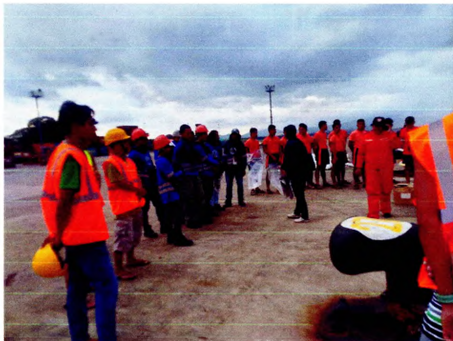
Briefing of PCG, PPA, and PCBSI Terminal Corp. teams by the PCG MEPS Group