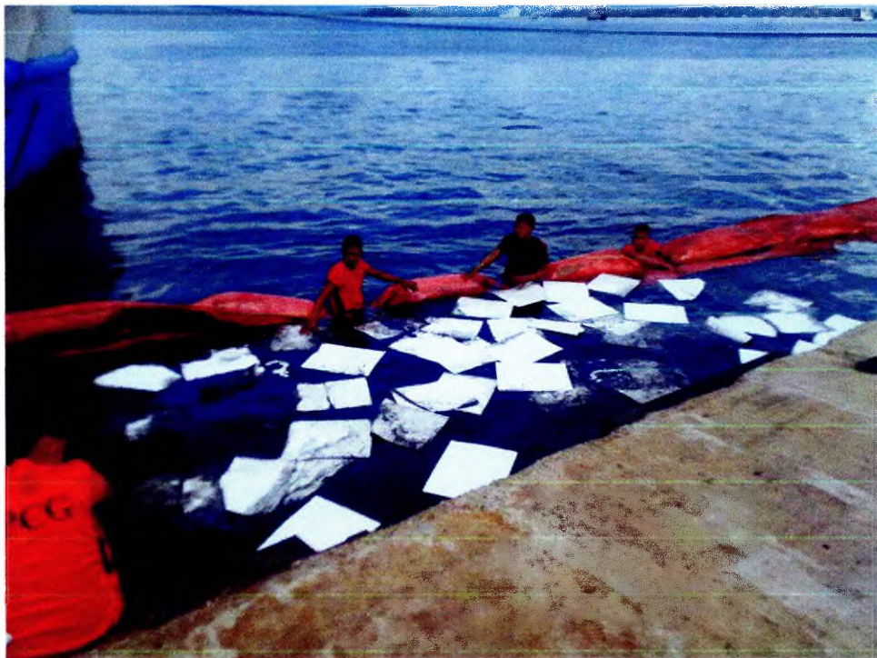
Absorbent pads to captivate the oil spill