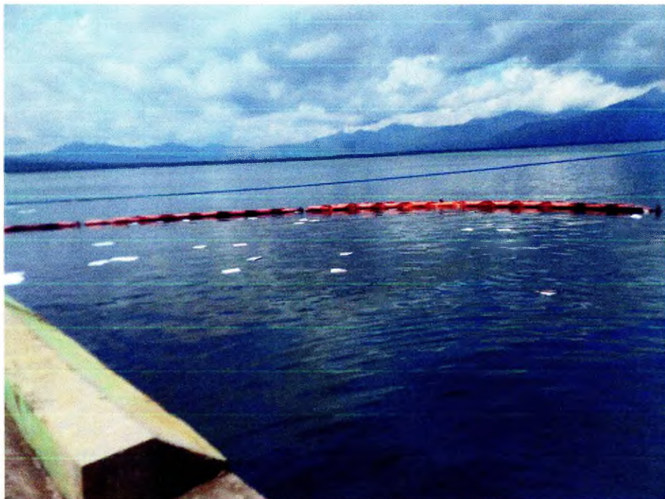
Spill booms at berths 9 and 10