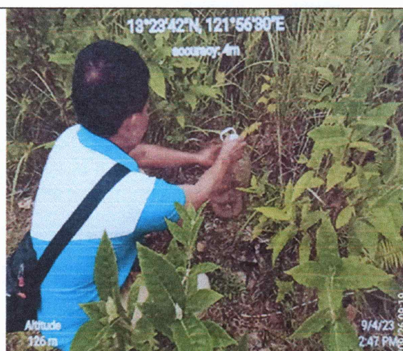
Releasing of Spitting Cobra in Barangay Boi, Boac, Marinduque