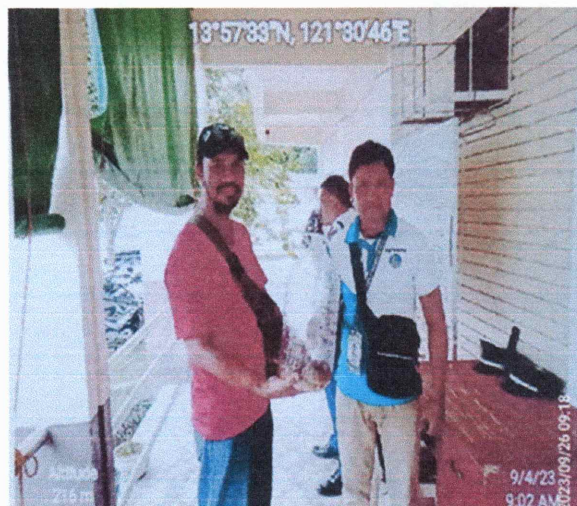
Turned-over Philippine Spitting Cobra