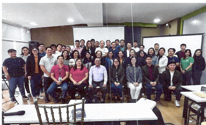
A Memorable Group Photograph Capturing the Presence and Unity of All Participants.